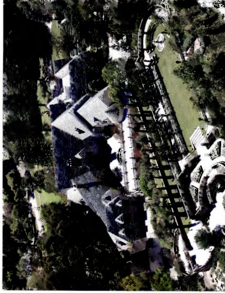
Grounds for Celebration: Greystone Mansion estate in Beverly Hills.