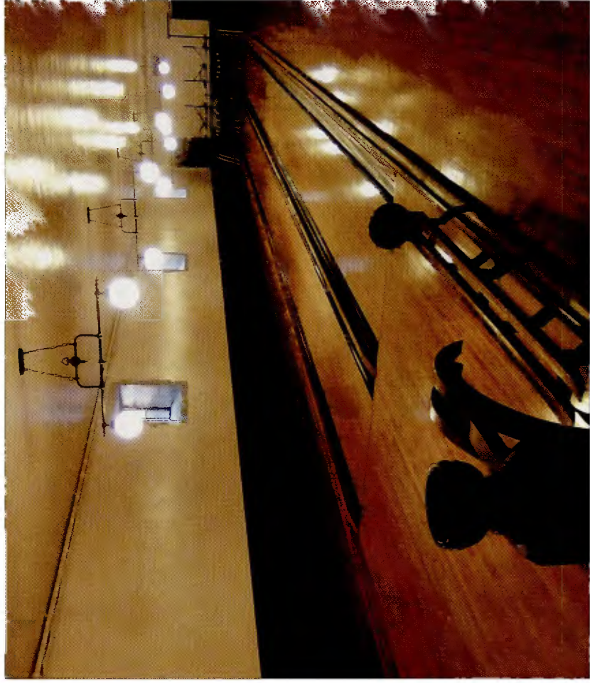
Roll Player: Bowling alley at Greystone Mansion used in 'There Will Be Blood.'

"She had a good vibe and felt a lot of parties in each of the rooms," Armijo recalled. "But before she went into the Murder Room she felt it was a crime scene."